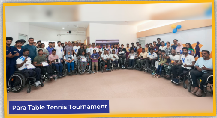
Para Table Tennis Tournament