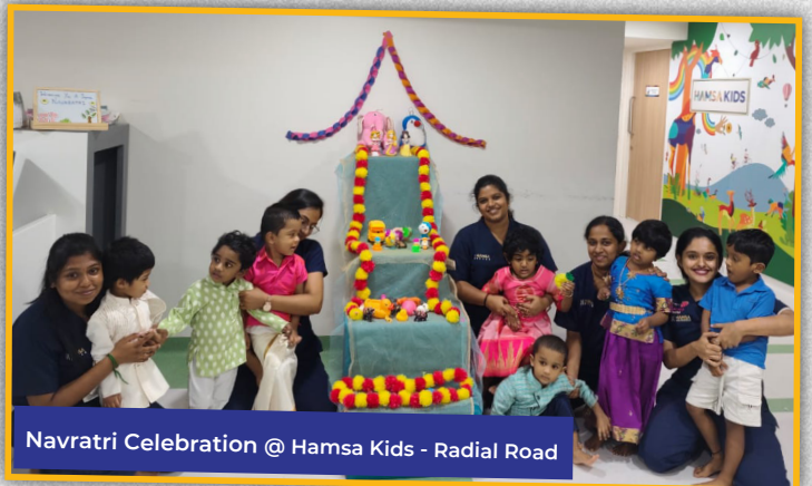
Navratri Celebration @ Hamsa Kids - Radial Road