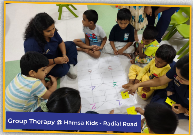
Group Therapy @ Hamsa Kids - Radial Road