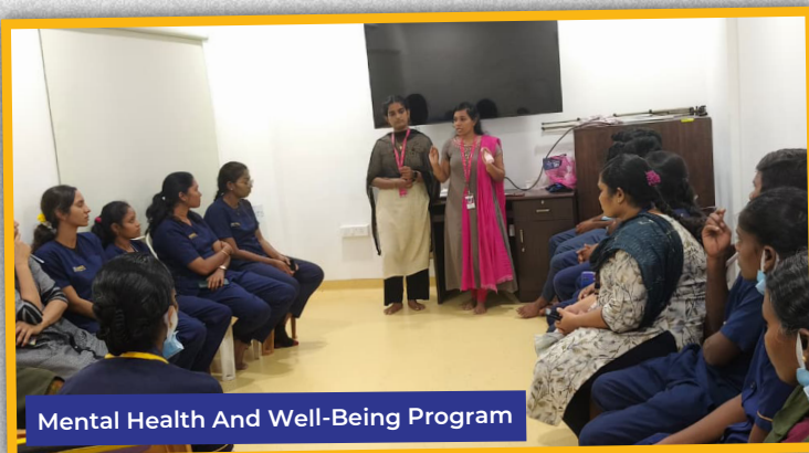
Mental Health And Well-Being Program