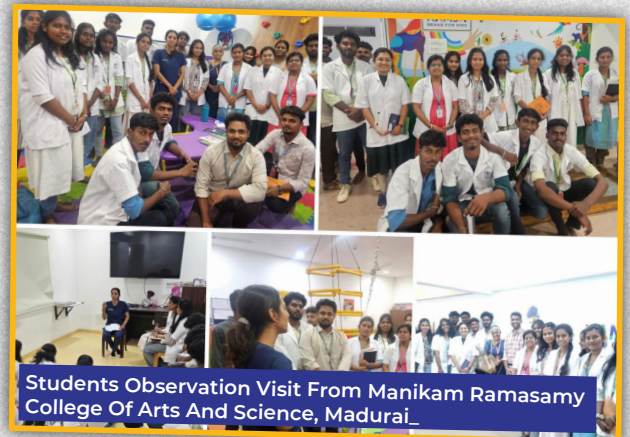
Students Observation Visit From Manikam Ramasamy College Of Arts And Science, Madurai_