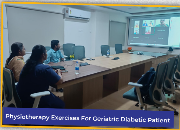
Physiotherapy Exercises For Geriatric Diabetic Patient