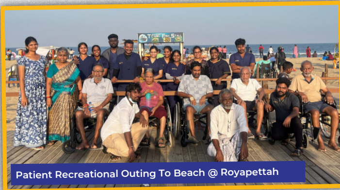
Patient Recreational Outing To Beach @ Royapettah