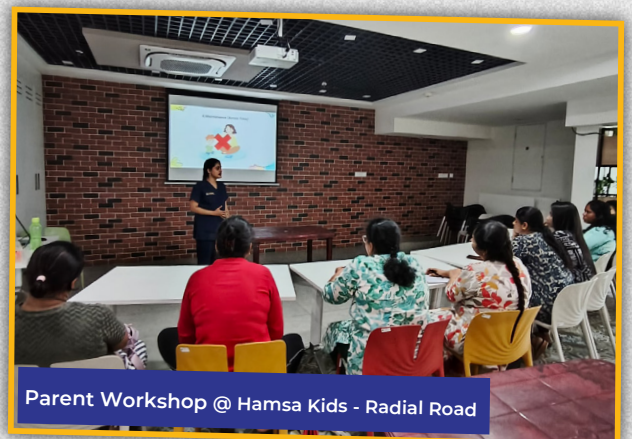
Parent Workshop @ Hamsa Kids - Radial Road