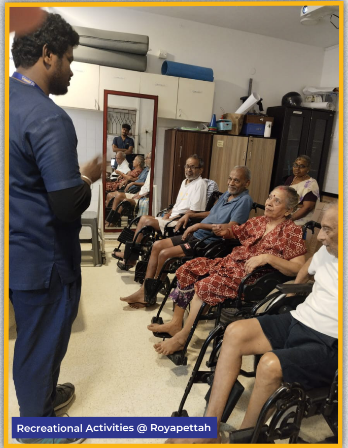
Recreational Activities @ Royapettah