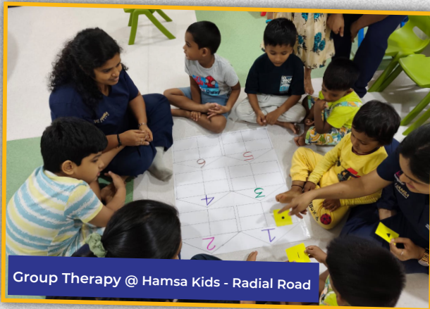
Group Therapy @ Hamsa Kids - Radial Road