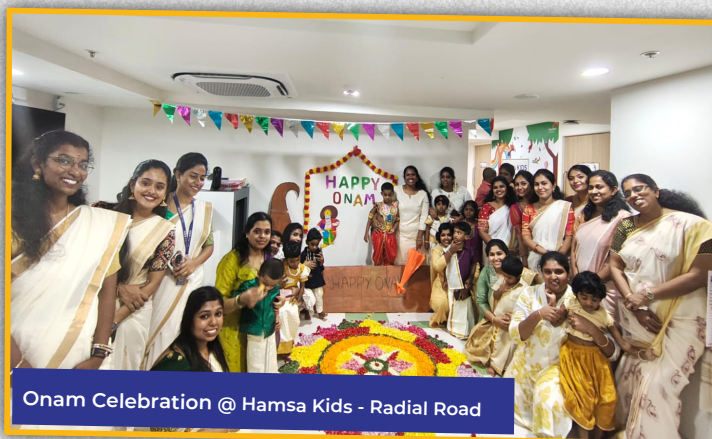
Onam Celebration @ Hamsa Kids - Radial Road