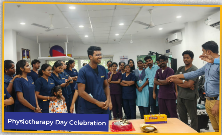
Physiotherapy Day Celebration