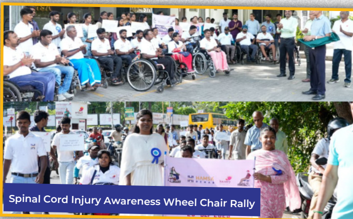
Spinal Cord Injury Awareness Wheel Chair Rally