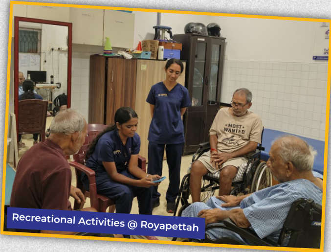
Recreational Activities @ Royapettah