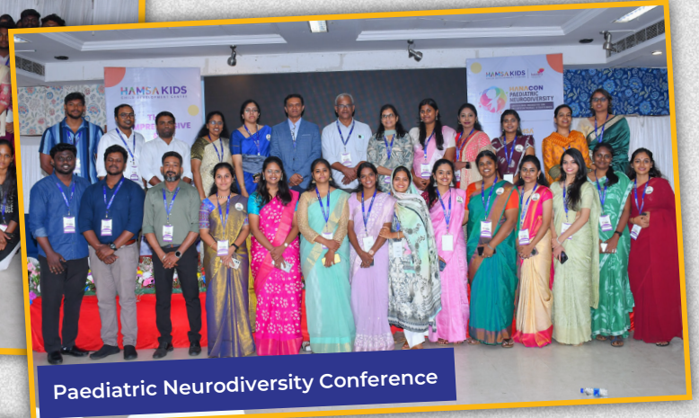
Paediatric Neurodiversity Conference