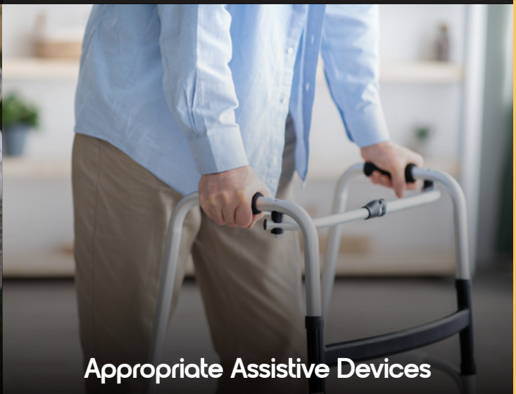
Appropriate Assistive Devices