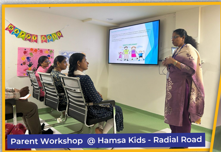
Parent Workshop @ Hamsa Kids - Radial Road