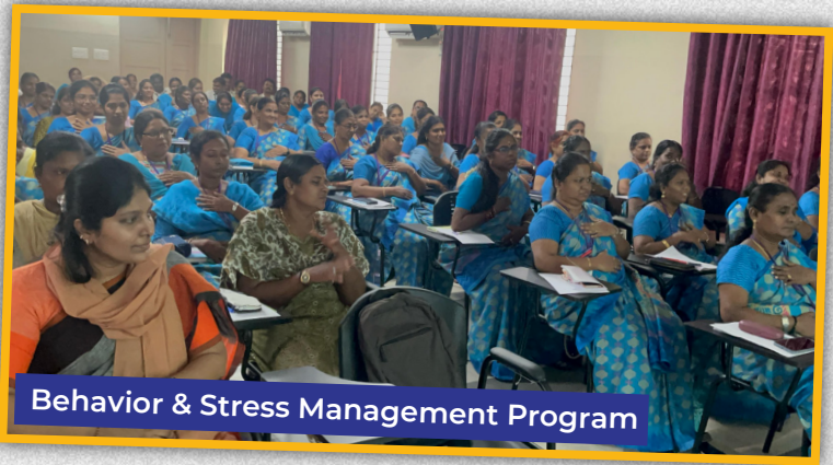
Behavior & Stress Management Program