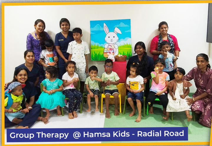
Group Therapy @ Hamsa Kids - Radial Road