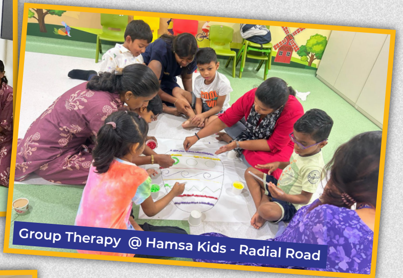
Group Therapy @ Hamsa Kids - Radial Road