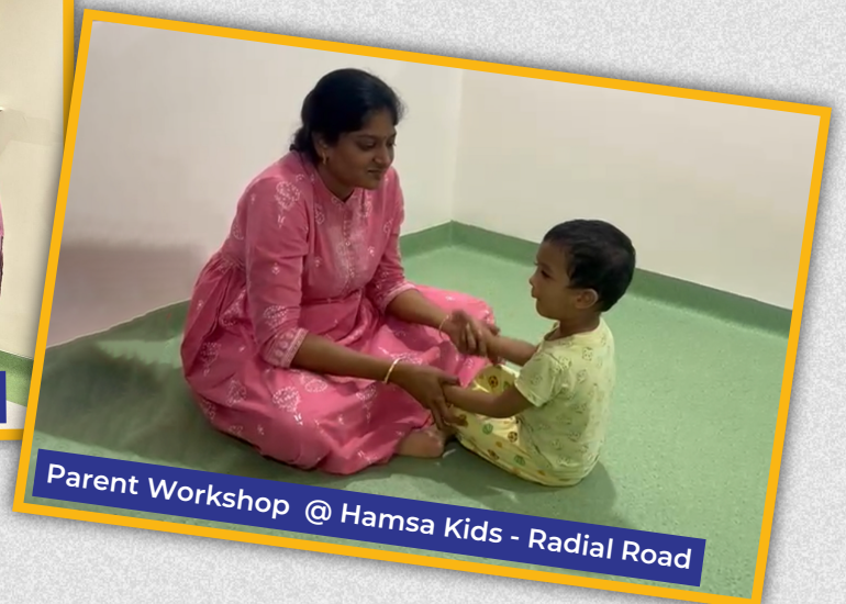
Parent Workshop @ Hamsa Kids - Radial Road