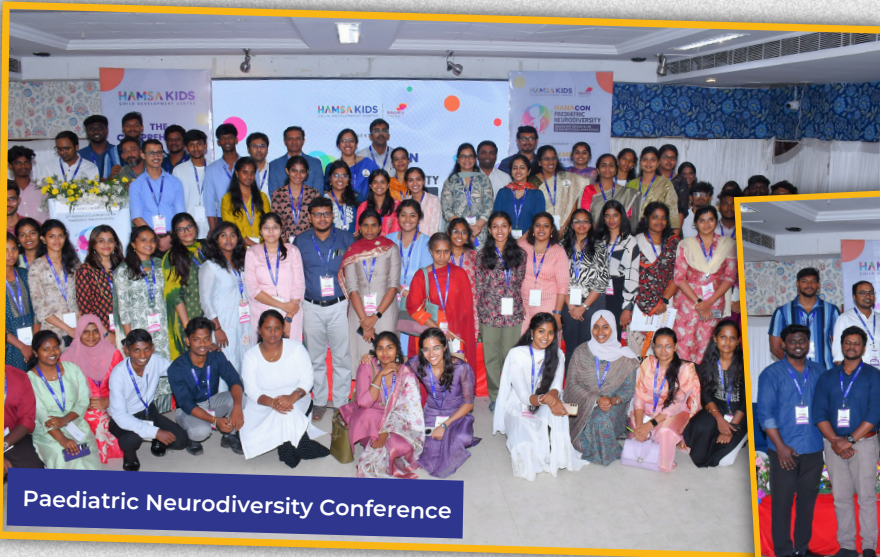
Paediatric Neurodiversity Conference