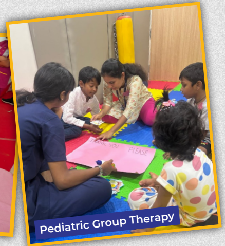
Pediatric Group Therapy