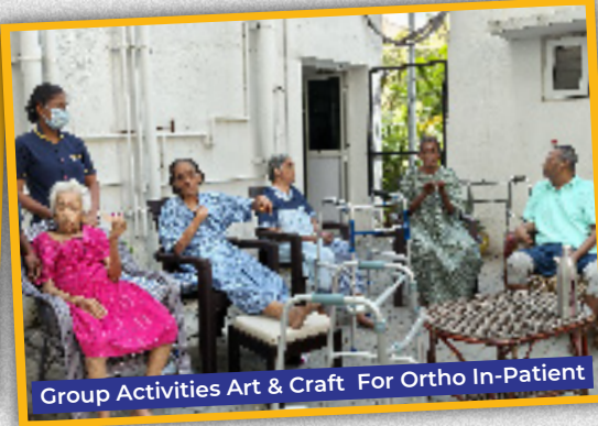
Group Activities Art & Craft For Ortho In-Patient