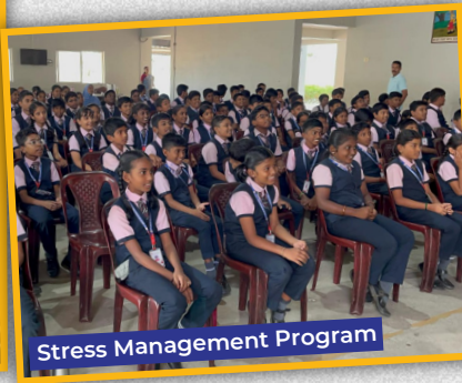
Stress Management Program