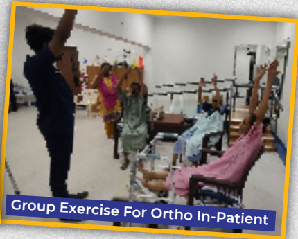
Group Exercise For Ortho In-Patient