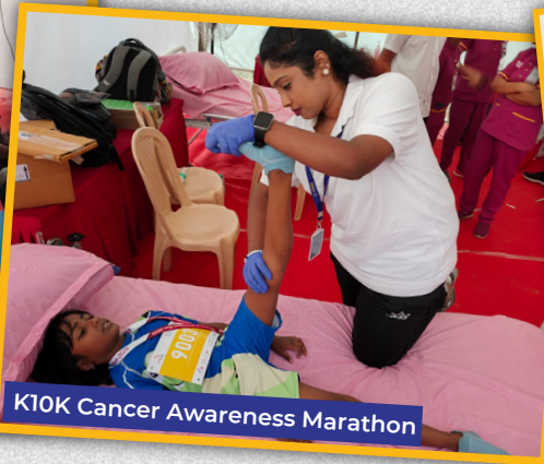
K10K Cancer Awareness Marathon