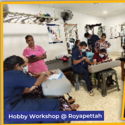
Hobby Workshop @ Royapettah