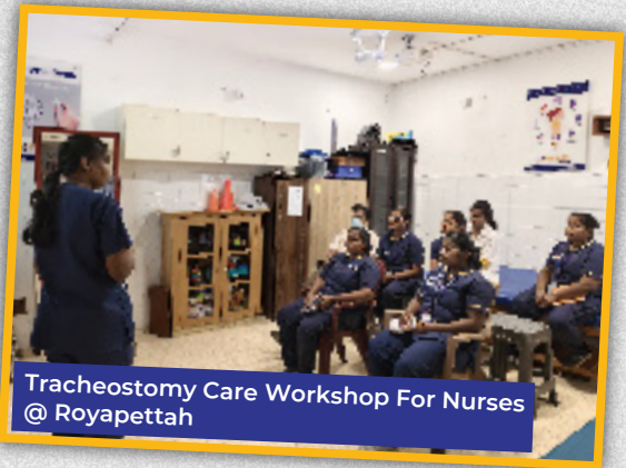
Tracheostomy Care Workshop For Nurses @ Royapettah