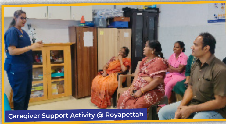
Caregiver Support Activity @ Royapettah