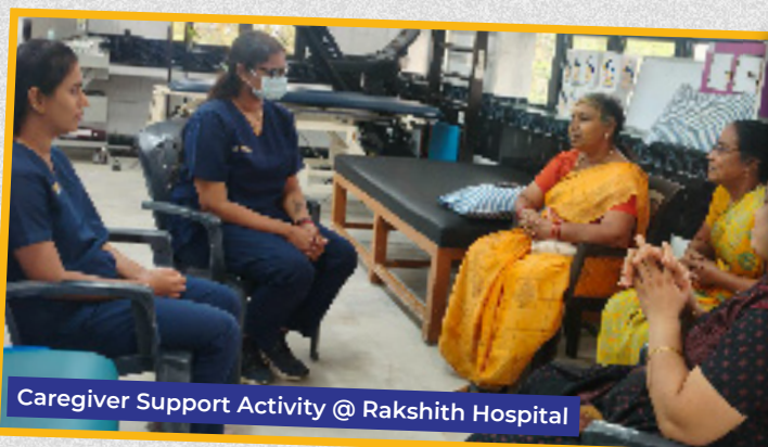
Caregiver Support Activity @ Rakshith Hospital