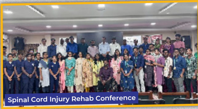
Spinal Cord Injury Rehab Conference