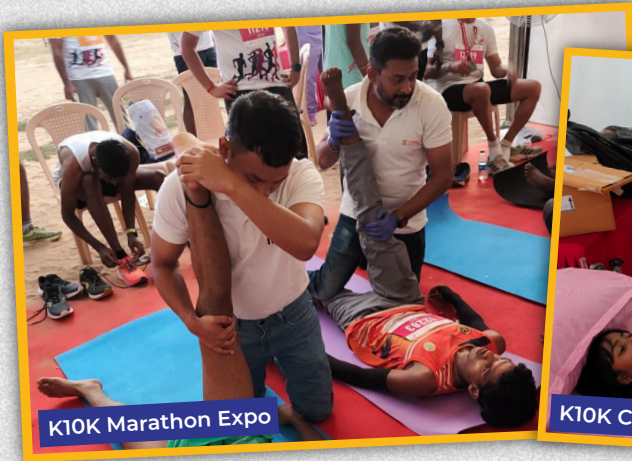
K10K Marathon Expo