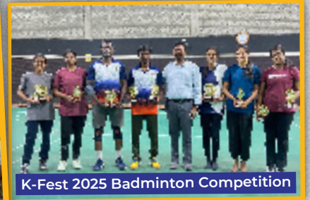
K-Fest 2025 Badminton Competition