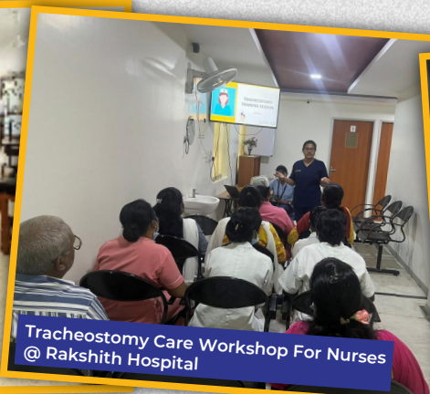
Tracheostomy Care Workshop For Nurses @ Rakshith Hospital