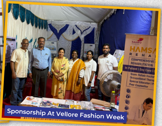
Sponsorship At Vellore Fashion Week